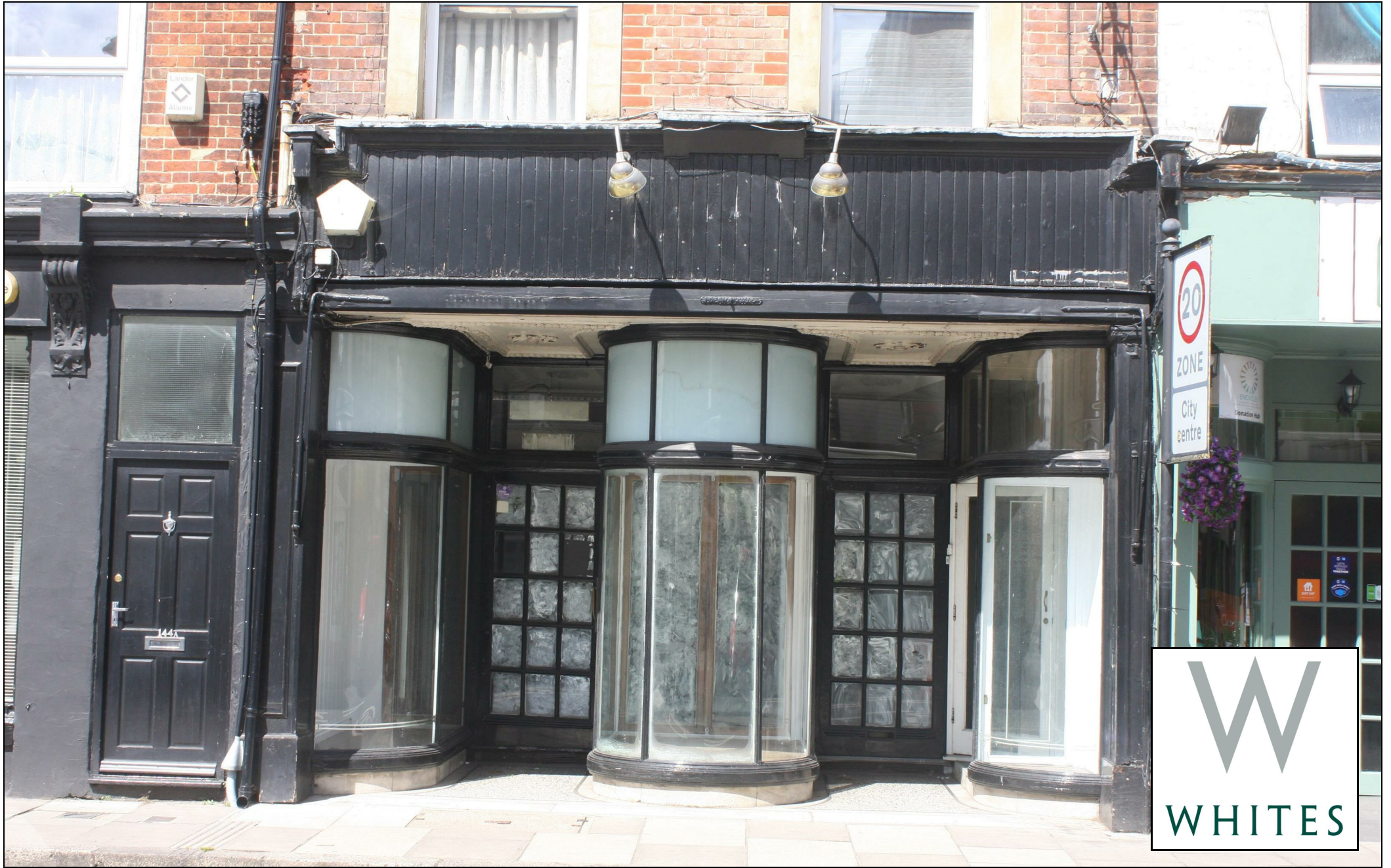
Shop at 142 Fisherton Street, Salisbury, Wiltshire, SP2 7QT